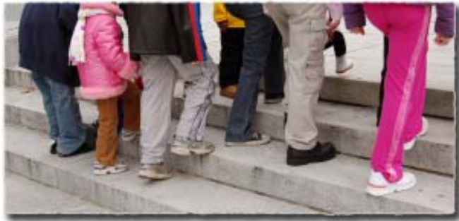
Take steps to lead us in the right direction!

A message from more than 125 member agencies of the Pennsylvania Council of Children, Youth & Family Services