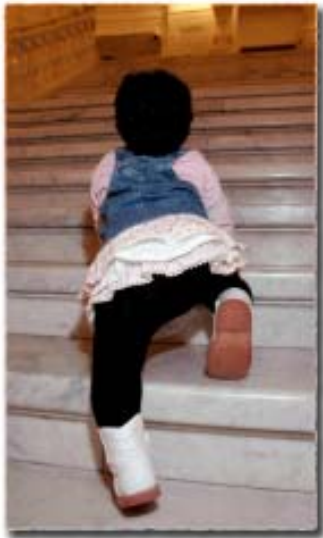
I can't do it by myself...

As you work to make the budget numbers balance against competing interests and priorities, we need your leadership to ensure that juvenile offenders are assisted to develop competencies and victim awareness and that they are held accountable for their actions.